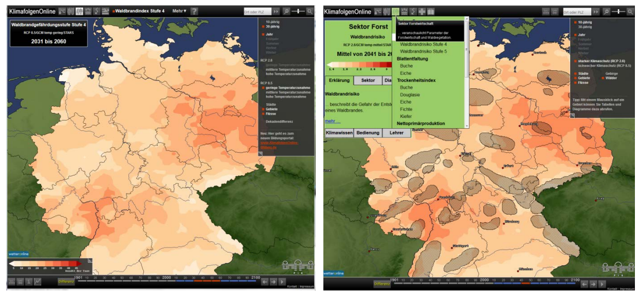
Figure 1: Screenshot of original climate impact tool with 30 year average as the standard setting (left); Screenshot of the redesigned education version www.KlimafolgenOnline-Bildung.de with 10 year average as the standard setting, presenting the new info box and colored pull-down menu (right)

Figure 1 on the left also provides a first impression of the shortcomings of the graphical user interface design of the original portal. The small info box on the left-hand side has proved too small to truly aid orientation. The color legend on the bottom left-hand side can be easily overlooked. Also, the original portal offered two separate helping systems (one can be activated by the bottom left-hand side ('i') and the other by the top ('?')). This has been a constant cause for confusion as users found it hard to find the information they required.