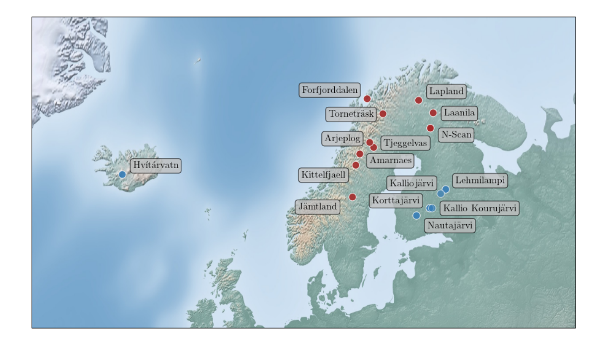
Figure 1: Geographical distribution of the paleoclimate archives used in this study. Tree ring records are shown in red, lake sediments in blue.

recent findings from the literature and an assessment of the timing of the observed periods of anomalous dynamics of the considered proxies. Although our method provides new aspects to the discussion of internal variability versus responses to external forcing, an unambiguous attribution of the identified dynamical anomalies to either of these two mechanisms is beyond the scope of the present investigations and remains a subject of future research.