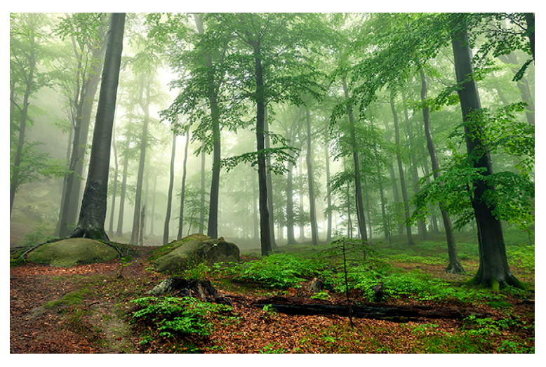
Safeguarding the biosphere from further degradation or collapse is an existential challenge for humanity. There are important steps we can take to contain the damage.

The recent Working Group 1 report of the sixth assessment of the Intergovernmental Panel on Climate Change (IPCC) confirmed this major nature contribution to climate stability, estimating the cumulative carbon sequestration by land and oceans to be 56% of all human-caused emissions between 1850 and 2019 (2). All major global climate models whose simulations give us hope of meeting the target of the Paris Climate Agreement—to keep warming well below 2 °C—take the continued provision of this gigantic biosphere endowment for granted, merely concluding, as in the recent IPCC report, that the efficiency of nature's carbon sink may reduce slightly for high