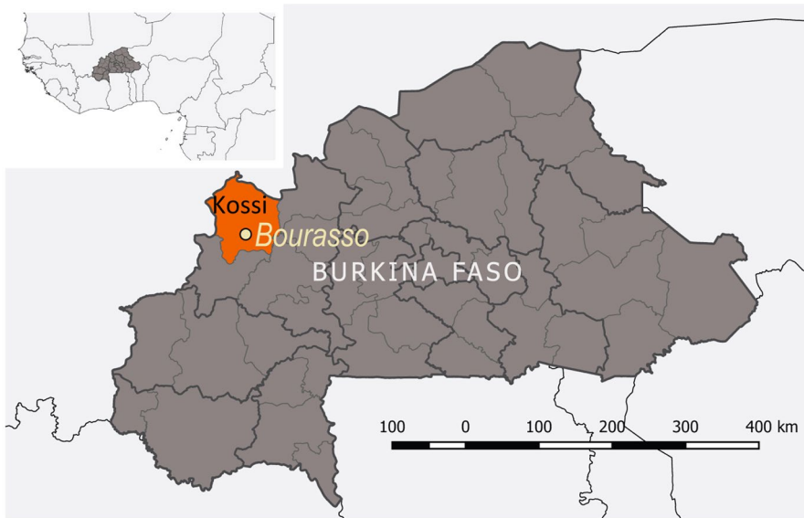
Fig. 1 Geographical location of the study village Bourasso

(“bas-fonds”), where surface water is retained long into the dry season. Bourasso has had food crop excesses for most of the past 20 years, allowing people to sell grains and use millet and sorghum to brew beer. This autochthonous village of approximately 3500 inhabitants was founded at least 200 years ago and comprises mostly farmers of the Bwaba ethnic group (87% of the population). In the area, Bwabas are known to be excellent farmers. Livestock plays a minor role in their livelihoods. (2) For the first time in living memory, a large number (> 50) of male subsistence farmers migrated out of this village to work on industrial plantations in neighbouring countries. This took place between November 2016 and February 2017 and lasted for 3.8 months on average.