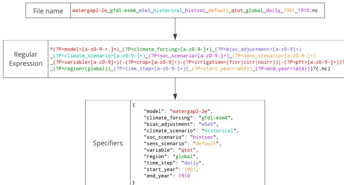
Figure 2: Metadata extraction using regular expressions: The file name consist of a set of specifiers which are defined in the ISIMIP Protocol. Using regular expressions we validate the file names and extract the specifiers into a dictionary.

To address these issues, the protocol for the current simulation rounds was implemented using a novel approach. Instead of one large document, the information is now stored in a set of smaller documents. The text part of the protocol, which contains mainly the introduction and notes on specific sectors, is written in markdown. Structured information is stored in JSON files. Both file formats are plain ASCII and are therefore perfectly suited to be version-controlled using Git. A set of Python scripts was developed to create a human readable, interactive web page 1 and a set of static sector specific, machine readable JSON files 2 . Using GitHub Actions we are able to run the build process every time a new commit is pushed to the GitHub repository. In addition to the JSON definitions, the protocol contains file name patterns for each sector. These patterns are regular expressions which convert the file names of the input and output files to a dictionary of specifiers (cp. Figure 2).