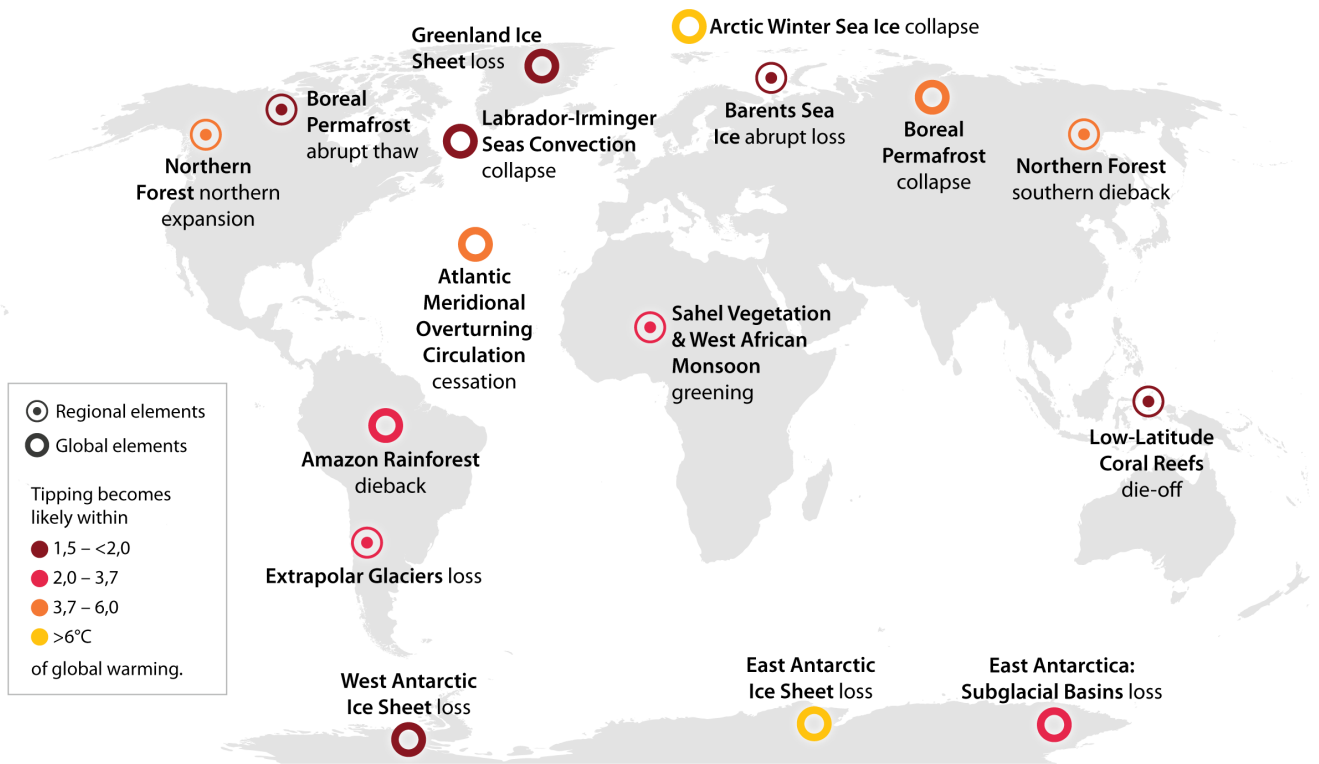
Fig. 1. A map of climate tipping elements, i.e., Earth system subdomains that determine the state of the climate system and are susceptible to dramatic change if global warming crosses threshold values corresponding to their tipping points. The ranges of global warming values where a tipping point is found for a specific tipping element are presented in colors (yellow for <math><2</math> °C, orange for 2 to 4 °C, and dark red for <math>\geq 4</math> °C). The map is derived from Armstrong McKay et al. (6) and printed with permission from the American Association for the Advancement of Science. See SI Appendix, Glossary for key definitions.

Crossing the tipping points will not only have environmental implications as their structure and functioning change (e.g., from stable to erratic regional rainfall) but is also likely to disrupt socio-economic and political systems that have developed with and are reliant on the stability of the Holocene (23). For instance, around 400 million people would directly suffer from a demise of tropical corals (51), and at 3 °C of global warming, over three billion people would be living in regions with health-threatening levels of heat (52). The same is true for the planetary boundaries, which, despite critique (reviewed in ref. 53), are considered precautionary "scientific assessments about what is safe, dangerous and unacceptable" (54, p. 83). Transgressing boundaries and undermining the functioning of biophysical systems already have severe multispecies justice implications for present and future